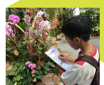
▲ Spiritual Education Outdoor Lesson