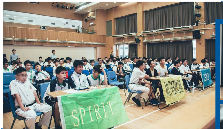
► Monopoly Deal

This year's Academic Week was held from 7<sup>th</sup> to 11<sup>th</sup> May 2018. Students were invited to participate in activities like Mathematics 4 Operations, Monopoly Deal card games and Book Exhibition in order for them to learn more about different subject knowledge. Among the activities, the Inter-house Academic Quiz was the most popular one.