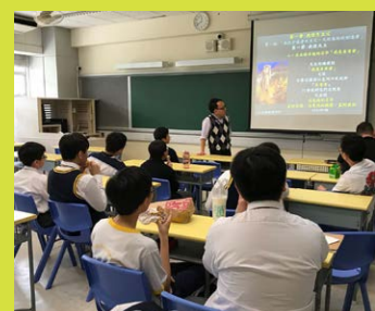
Lunch Time Catechism Class