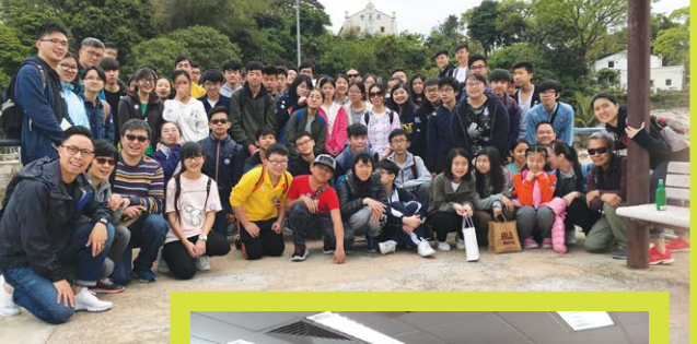
▲ Joint School Yim Tin Tsai