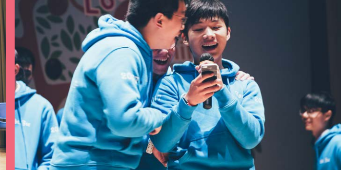
Performances by F6 classes