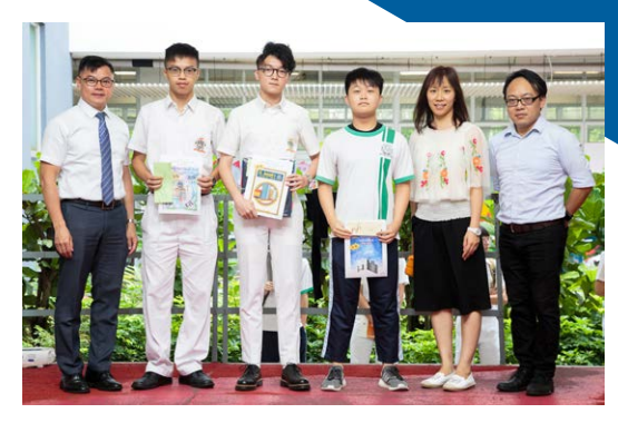
▲ Student Handbook Cover Desgn Competition