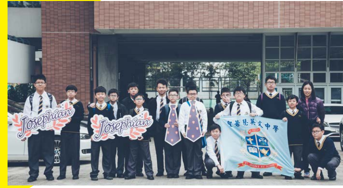
▲ Walkathon captured at Old Campus