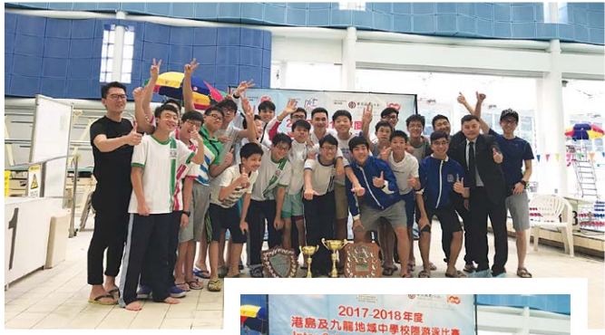
▲ Swimming Team